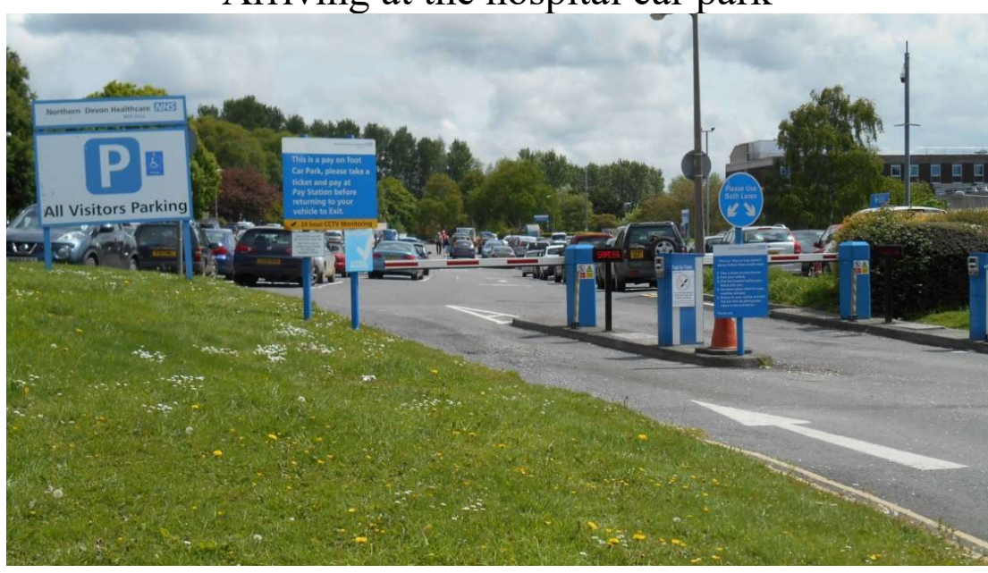
Walk from the car park to the hospital entrance